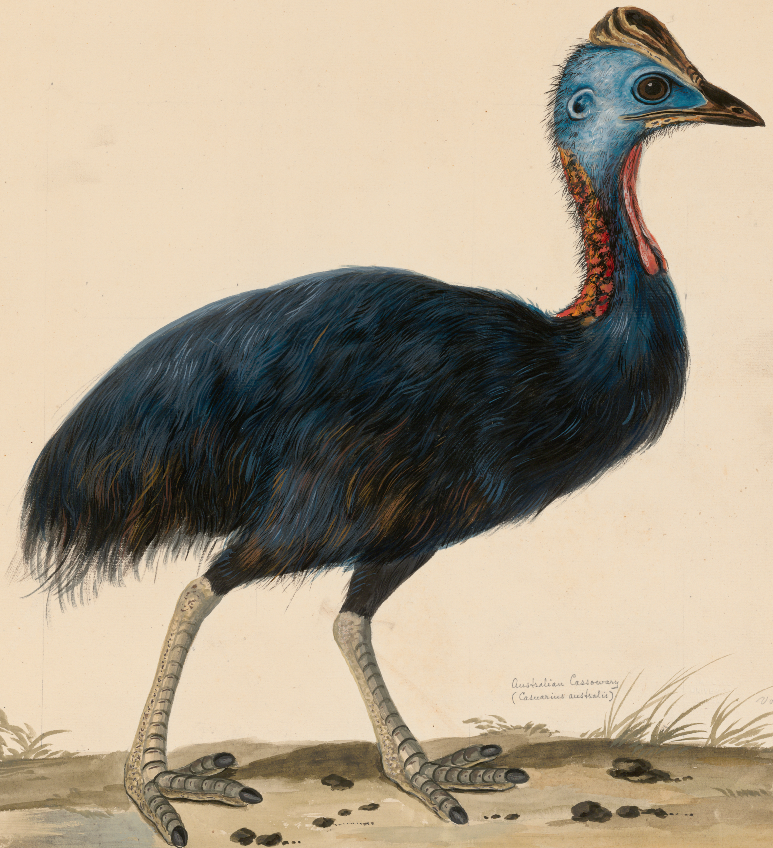
Australian Cassowary ( Casuarus australis )