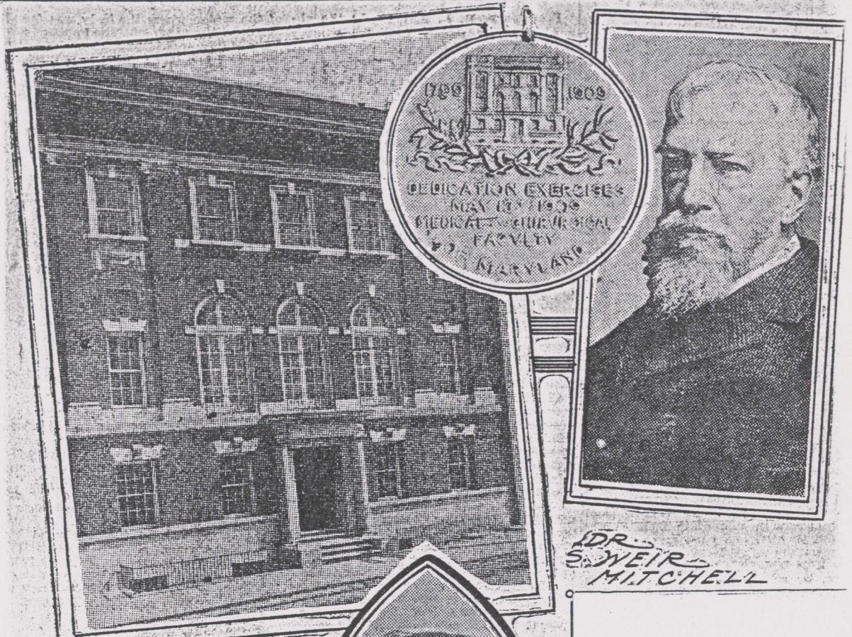
DR. S. WEIR MITCHELL