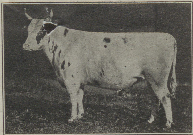
HOBSLAND VICTORY 73683

Importers and Breeders of Ayrshire Cattle, Clydesdale Horses and Yorkshire Swine