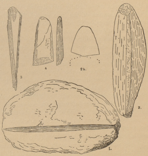
(All the figures one-fourth actual size.)

Having been thus roughly blocked out by sawing, the surfaces of the adze were next generally ground flat. In the more finely worked specimens, this subsequent grinding has almost or altogether obliterated the original shaping furrows, and the surfaces have eventually been well polished.