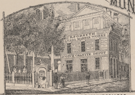
OFFICE 130, BLEURY ST. FRONT OF JESUIT COLLEGE

IMPORTER AND MANUFACTURER OF MARBLE & SLATE MANTELS. FLOORING & SLATE AND MARBLE TILES. MOSAIC & ENCAUSTIC TILING. PLUMBERS AND FURNITURE. MARBLES. MURAL TABLETS AND BAPTISMAL FONTS.