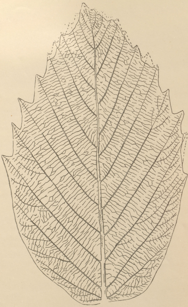
Quercus platania , Heer.

To illustrate Sir William Dawson's Paper on New Fossil Plants from the Northwest.